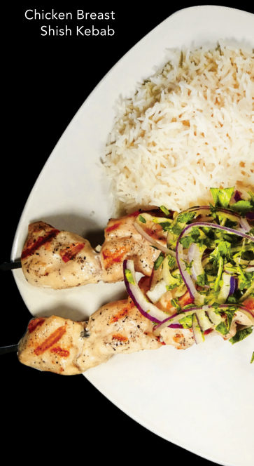
Chicken Breast Shish Kebab